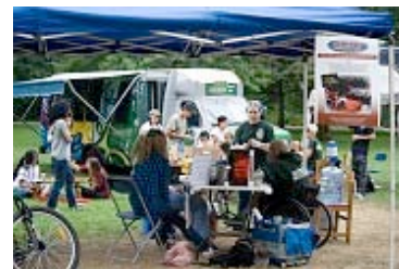
PoCoMo hosts the FUN DAY IN THE PARK