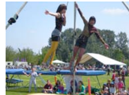
ACRiX at the Teddy Bear Picnic in Coquitlam